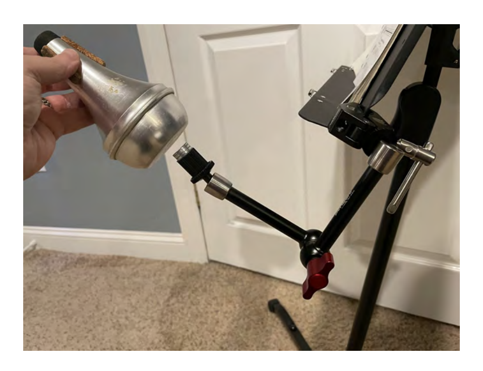
GEN I MODEL (~$10.00 of parts)